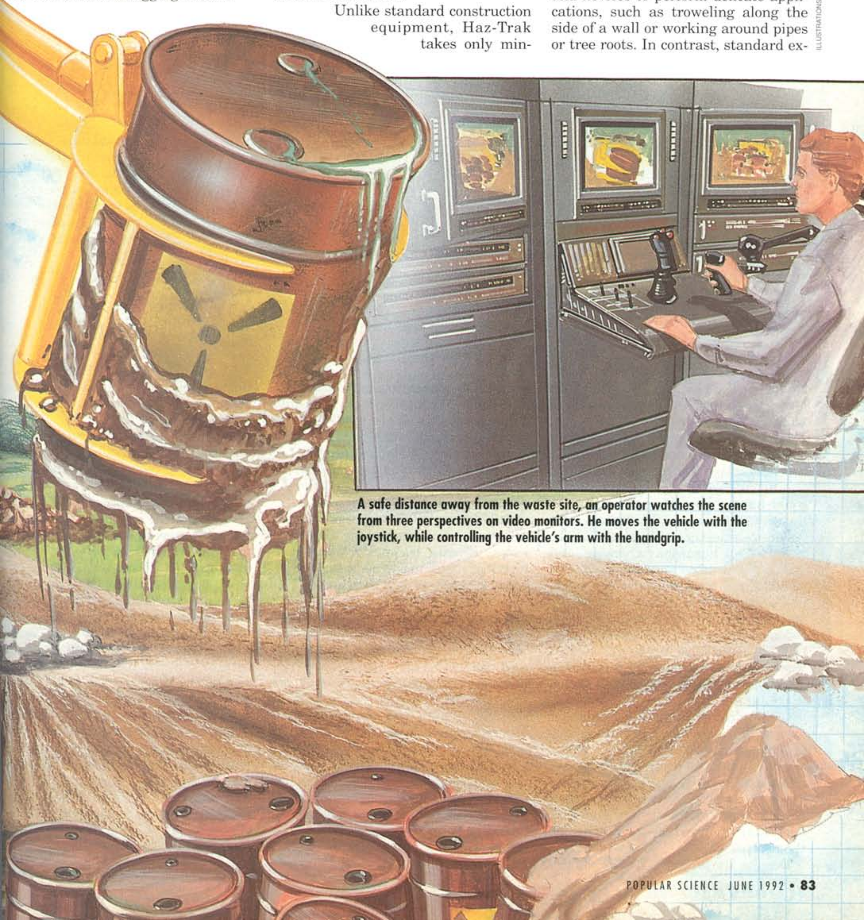
A safe distance away from the waste site, an operator watches the scene from three perspectives on video monitors. He moves the vehicle with the joystick, while controlling the vehicle's arm with the handgrip.